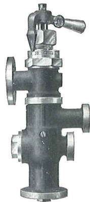
fig 1291...the Holden & Brooke original "One Movement" In- jector

Made for pressures up to 350 lbs if required